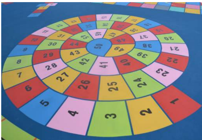
Isabella State School, Edmonton, QLD