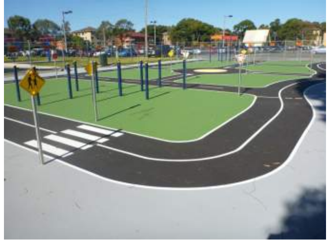
Collimore Park, Liverpool, NSW

A range of UV stable colours are available.