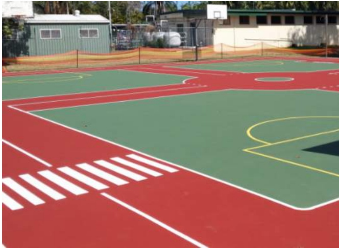
Edge Hill State School, Cairns, QLD

SYNPAVE PLAY is a pre-mixed, pre-coloured water based, slip-resistant UV stable coating with excellent performance against wear and weathering, providing a rejuvenated fresh and safe surface coating that is suitable for internal and external use.