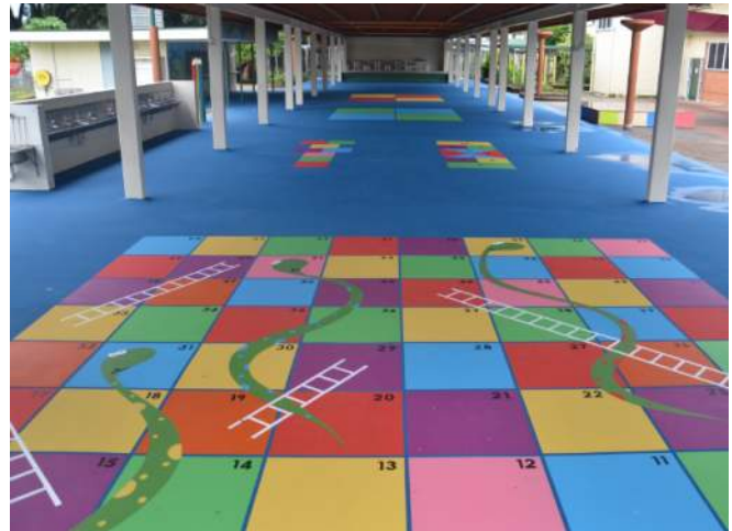
Edge Hill State School, Cairns, QLD